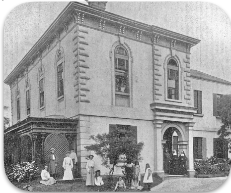
The School in Melbourne, 1906