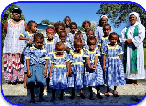
Some of the Kindergarten at TnK in their new uniforms