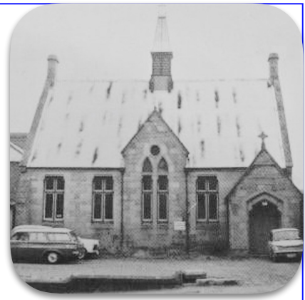
St. David's, the first school