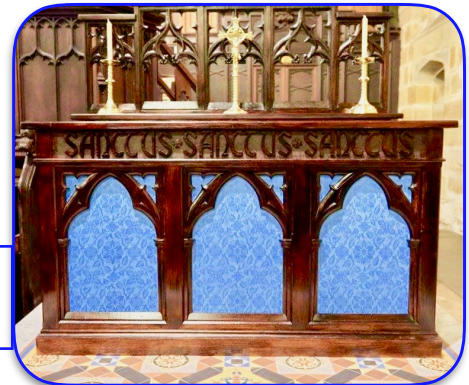
The Altar from St. Gabriel's School, now in Christ Church St. Laurence

As I have endeavoured to enter into a ministry of forgiveness and reconciliation, I have come to understand more fully the life God is calling me to live in the Community. The giving of myself to God through the vows of poverty, chastity and obedience has changed, and is changing how I relate, respond and engage with God, myself, others, and life situations. It has led me towards a greater dependence on God, a willingness to love others as God loves me and an obedience to God's call and particularly the responsibility that comes from being in leadership.